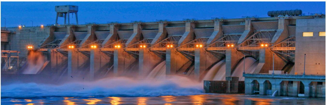
Ice Harbor Dam — capacity 603 megawatts, energized in 1961.

A key benefit of the federal dams is clean air. These dams produce a lot of energy and no greenhouse gas emissions. This gives the Northwest an environmental edge unmatched elsewhere in the country, where power production is largely based on fossil fuels.