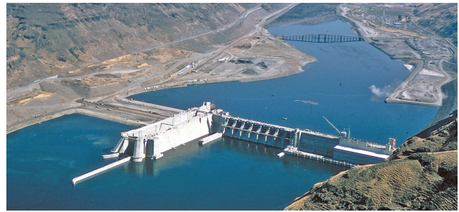
Lower Granite Dam — capacity 810 megawatts, energized in 1975

The Northwest Power and Conservation Council estimated the social costs of continued CO 2 emissions to the region over time. 4 Using the Council's social cost of carbon analysis, BPA estimates that replacing the four lower Snake River dams with gas-fired generation would have an associated social carbon cost of $98 million to $381 million each year.