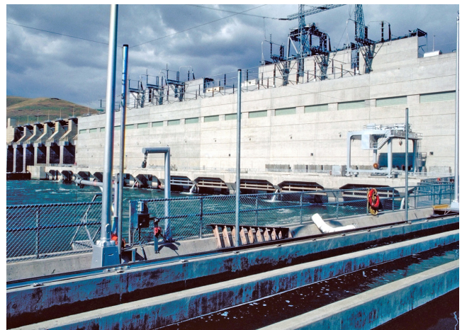
Little Goose Dam — capacity 810 megawatts, energized in 1970

The most technically and economically feasible generation replacement for the lower Snake River dams would likely be natural gas turbines. New natural gas generators could increase transmission congestion depending on their location, and would likely require additional transmission