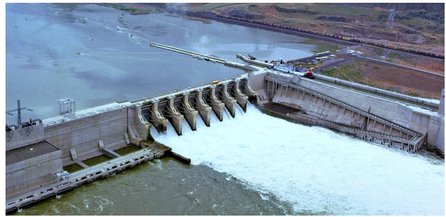
Lower Monumental Dam — capacity 810 megawatts, energized in 1969

The average energy output of a generator is also helpful when making comparisons. The four lower Snake River dams produce 1,004 average megawatts 5 each year. For comparison, the Boardman coal plant in Oregon provides 489 aMW. As an additional point of comparison, three