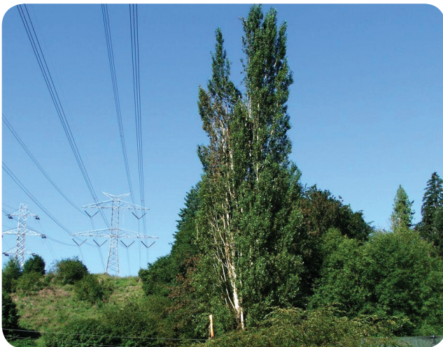
Trees that grow too close to high-voltage power lines are a hazard. In certain circumstances, electricity can jump or arc from the lines to the trees, which can cause power outages, fires and serious injuries to anyone near the trees.

As a result, the North American Electric Reliability Corporation, or NERC — a national regulatory body that oversees reliability of the U.S. power grids — issued new, more stringent, vegetation management standards for electric transmission lines. BPA and