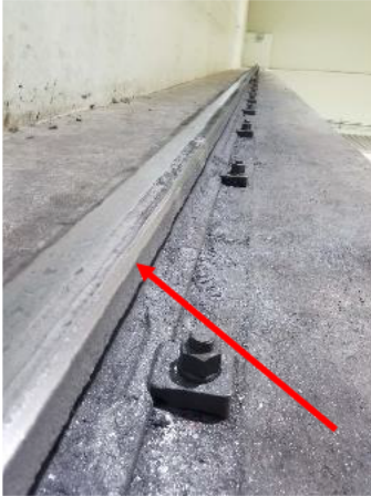
Photo 9: Downstream rail filleting and metal dust generated from the wheel and rail contact.