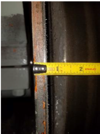
Photo 7: Wheel 20 Flange Visual Inspection (67% of Original Thickness)