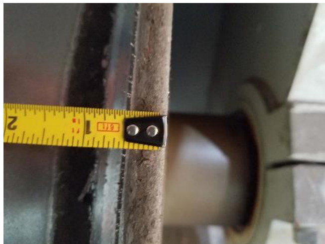
Photo 4: Wheel 4 Flange Visual Inspection (66% of Original Thickness)