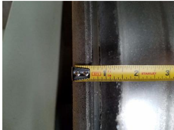
Photo 2: Wheel 6 Flange Visual Inspection (70% of Original Thickness)