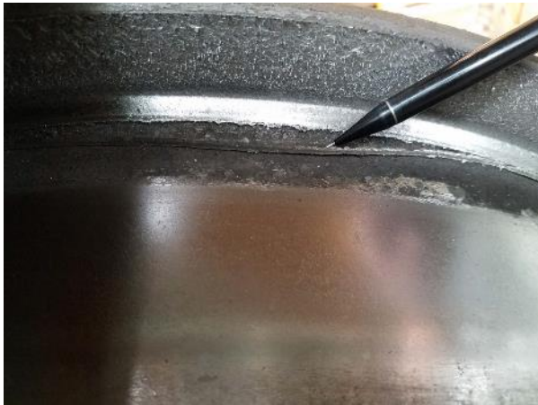
Photo 1: Wheel 6 Flange Wear – Bulk Material “Sheared” Off from Wheel

Overall, the average remaining thickness left on the downstream idler wheel flanges (wheels 1, 3 through 10, and 12) is 78%, with the thinnest flange thickness at 63% of its original thickness (wheel 3). The average remaining thickness left on the upstream idler wheel flanges (wheels 13, 15 to 22, and 24) is 76%, with the thinnest flange thickness at 67% of its original thickness (wheel 20).