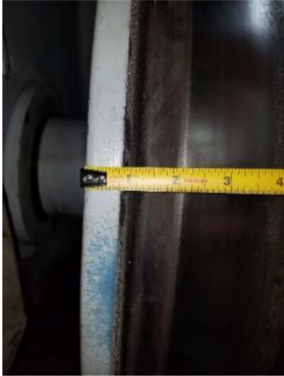
Photo 5: Wheel 1 Flange Visual Inspection (97% of Original Thickness)