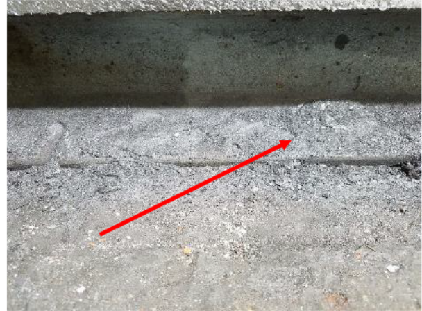
Photo 10: Metal dust generated from the wheel and rail contact during crane movement.