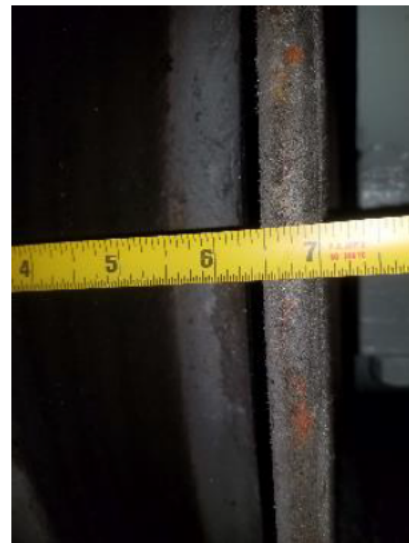
Photo 8: Wheel 21 Flange Visual Inspection (68% of Original Thickness)