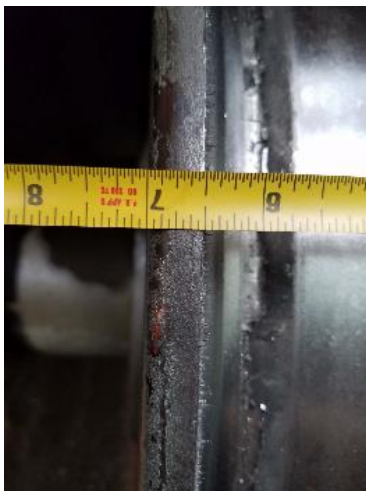
Photo 3: Wheel 3 Flange Visual Inspection Thinnest (63% of Original Thickness)