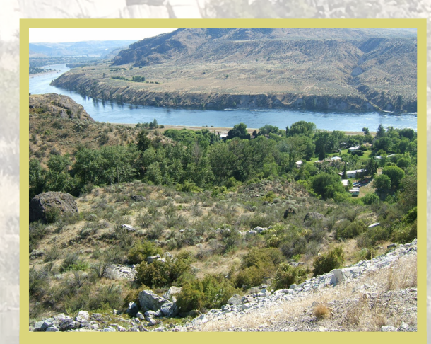
Overview of the deer hunting area known as sk'ix.

"fence" deer hunting area near Seaton's Grove, WA