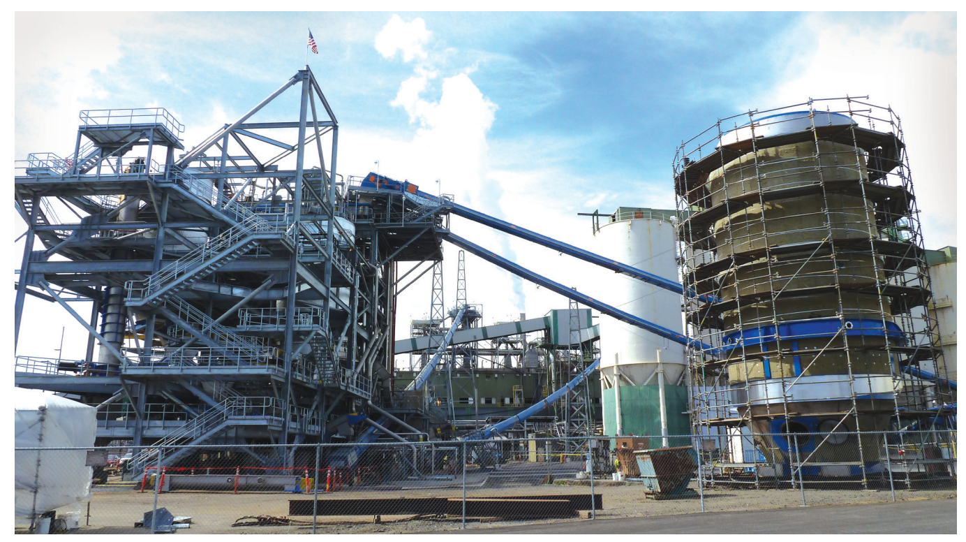
Large industrial facilities may have flexibility in their power use - they are good candidates for utility-scale demand response aggregator projects.

congestion along the Interstate 5 corridor, and a winter capacity product to shave peak energy use.