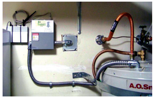
Demand response controllers on residential equipment such as water heaters can help grid managers keep the power system in balance.

Demand response enables industrial and residential consumers to play a significant role in the operation of the electric grid by reducing their energy use during times of peak demand in response to time-based rates or other forms of financial incentives. Electric system planners and operators are using demand response programs as resource options for balancing supply and demand.