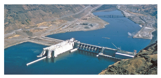
Lower Granite Dam — capacity 810 megawatts, energized in 1975

The Northwest Power and Conservation Council estimated the social costs of continued CO<sub>2</sub> emissions to the region over time.<sup>4</sup> Using the Council's social cost of carbon analysis, BPA estimates that replacing the four lower Snake River dams with gas-fired generation would have an associated social carbon cost of $98 million to $381 million each year.