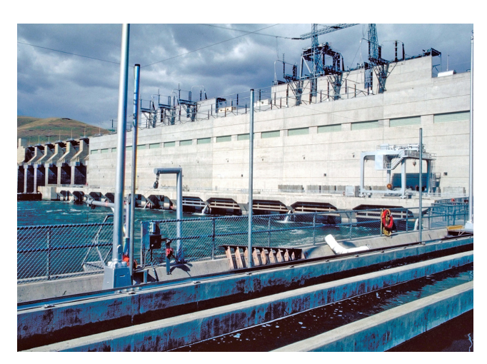
Little Goose Dam — capacity 810 megawatts, energized in 1970

The most technically and economically feasible generation replacement for the lower Snake River dams would likely be natural gas turbines. New natural gas generators could increase transmission congestion depending on their location, and would likely require additional transmission