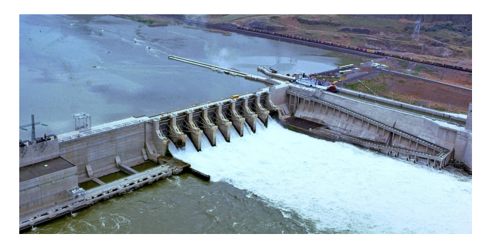
Lower Monumental Dam - capacity 810 megawatts, energized in 1969

The lower Snake River dams are significant energy resources.