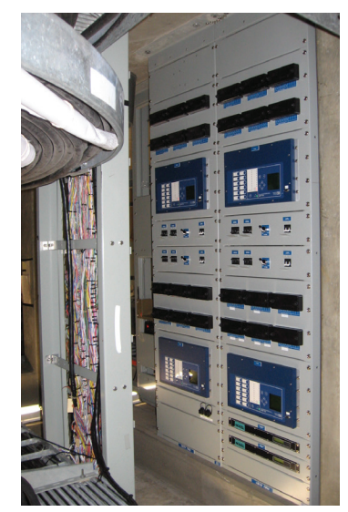
BPA has installed more than 100 phasor measurement units. These shoe-box sized devices transmit a feed of precise power system data that provides operators a higherresolution view of the grid.

A little over ten years later, federal funding boosted synchrophasor program development across North America. That advancement serendipitously coincided with fiber optic communications investments BPA was making on its system. As it turns out, the increased bandwidth of BPA's fiber network was instrumental in moving the tremendous volume of data generated by synchrophasors. Synchrophasor units take synchronized measurements many