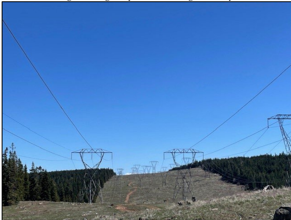
Figure 2. Big Eddy-Ostrander Right-of-Way

Note: The transmission lines pictured from left to right are Big Eddy-Troutdale No. 1, Big Eddy-Chemewa No. 1, Big Eddy-McLoughlin No. 1, and Big Eddy-Ostrander No. 1.