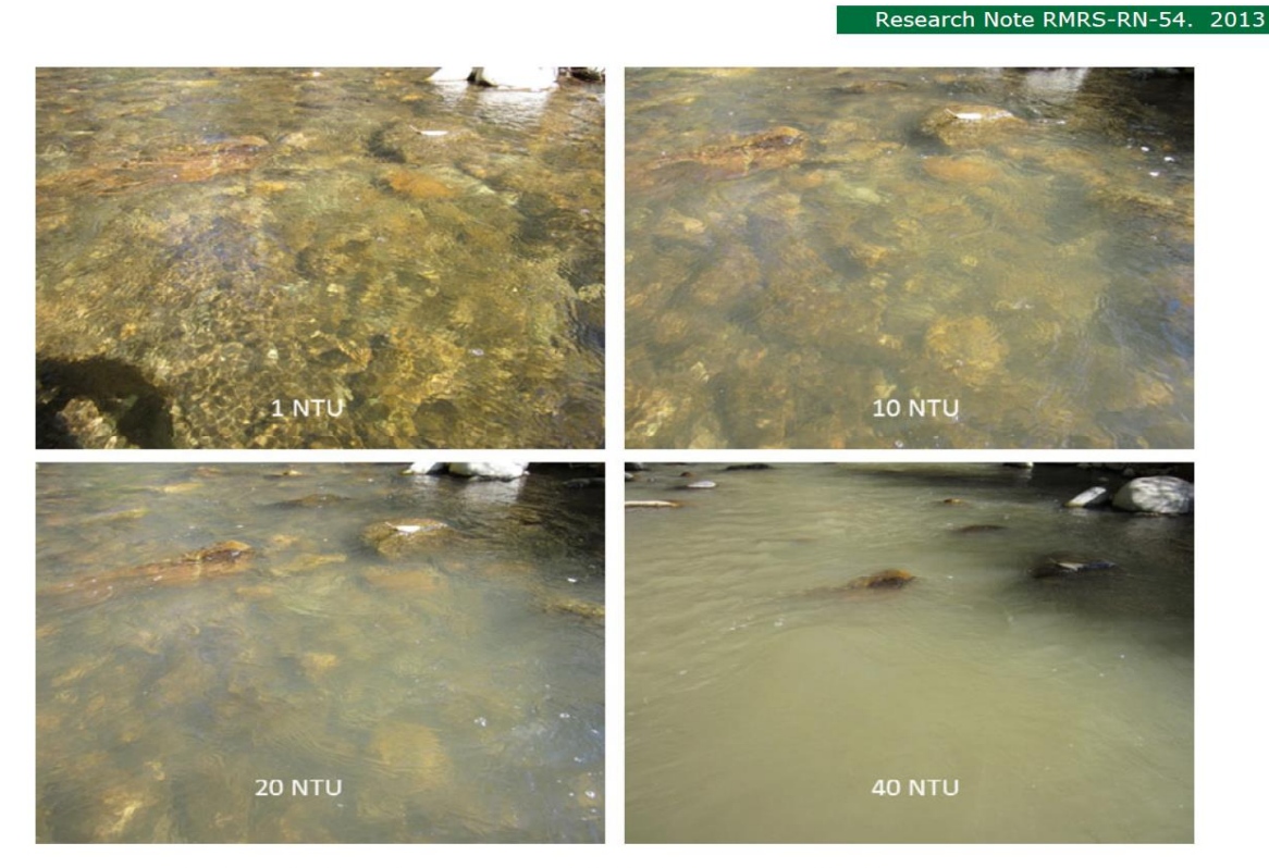
Figure 9 – Turbidity levels in Carmen Creek during Parmenter Lane culvert upgrade.