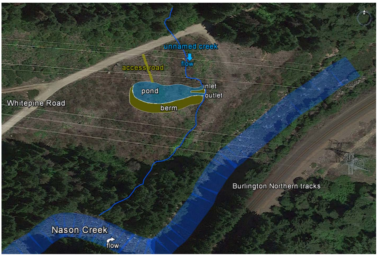
Figure 3 Powerline acclimation facility site layout

Creation of roughened channels for both inlet and outlet (see below)