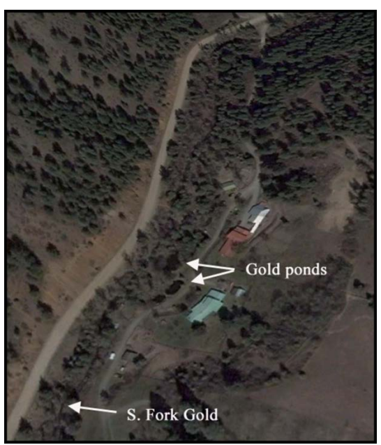
Figure A-4. Gold Creek Acclimation Facility