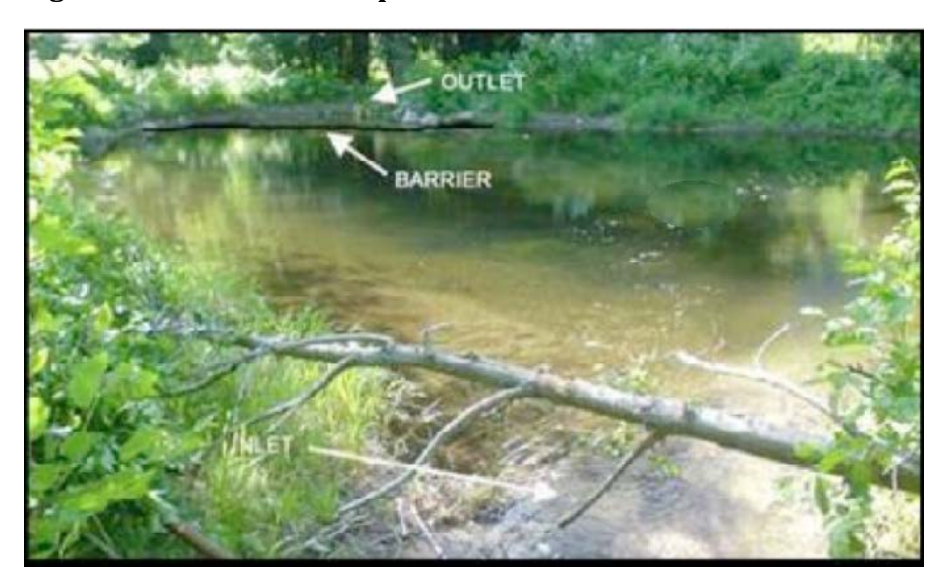
Figure 5 Barrier net example

Seine nets (Figure 6) would be used at acclimation sites to partition off a portion of a waterbody while allowing free upstream and downstream passage of all life stages of non-confined ESA-listed fish. In waterbodies where existing young spring Chinook could be present, the seine nets would be made of a fine mesh to prevent fry from entering enclosed areas and becoming prey for the acclimating Chinook or steelhead.