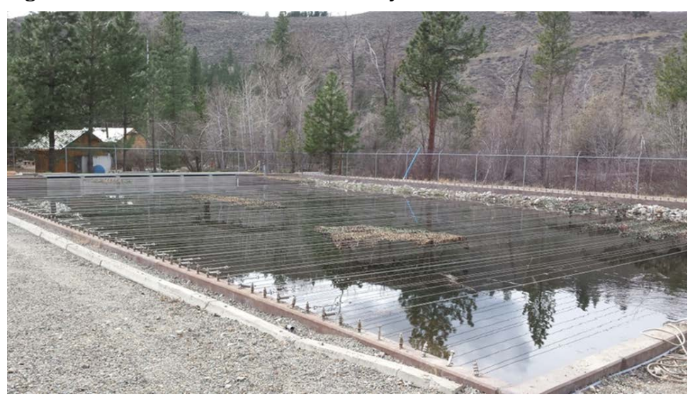
Figure A-1. Chewuch Acclimation Facility