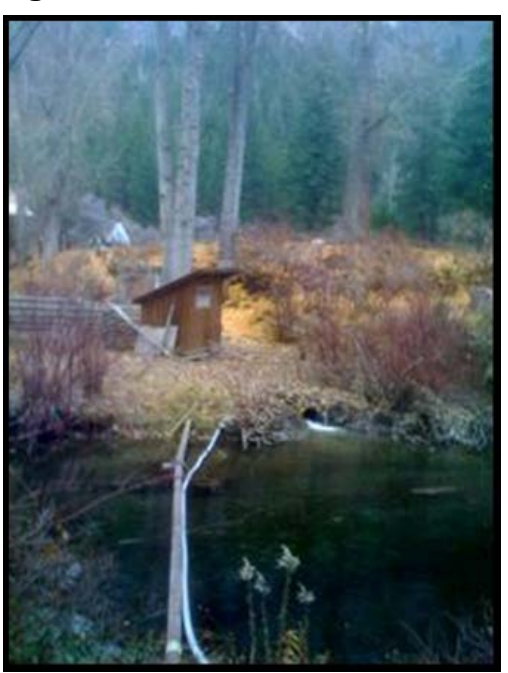
Figure A-2. Goat Wall Acclimation Facility