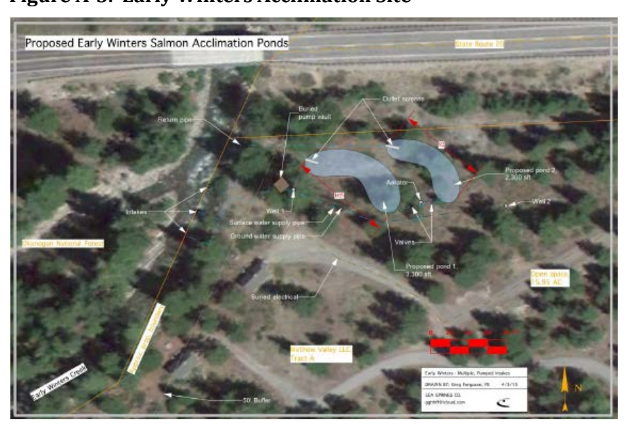
Figure A-3. Early Winters Acclimation Site