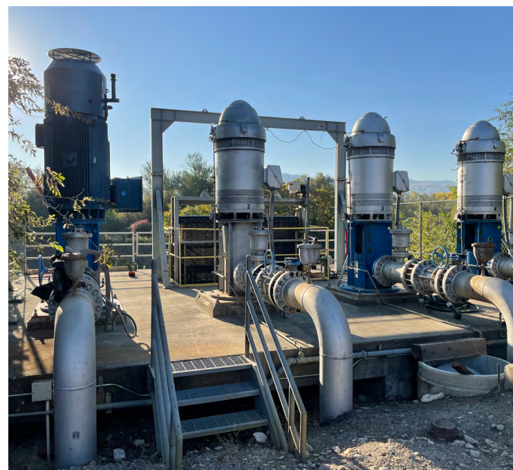
New 800hp stainless steel pumps (blue)