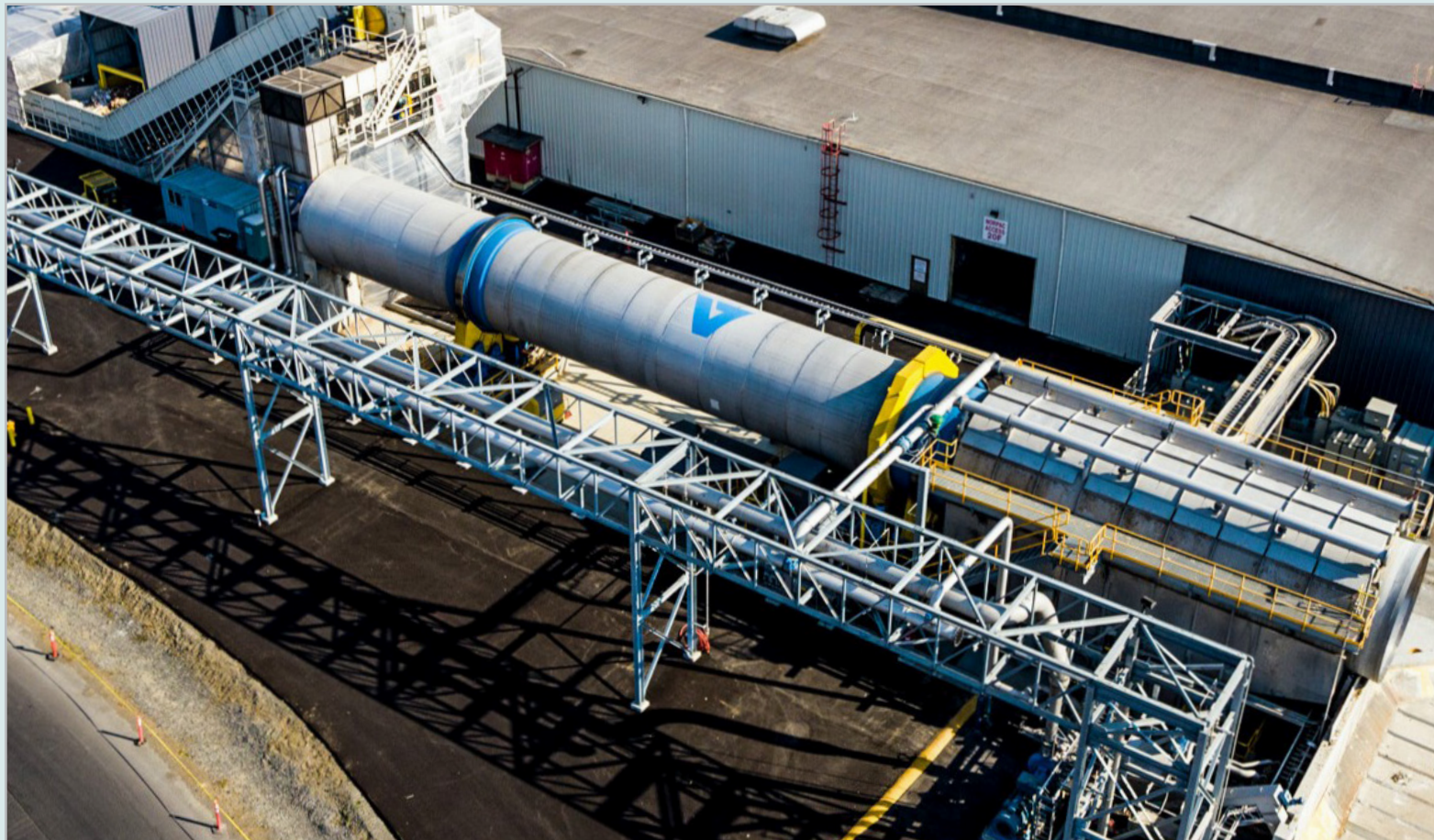
New RFP Drum Pulper

The new drum pulper allows NORPAC to expand operations to recycle wastepaper from across Washington and Oregon and save it from going into the landfill. NORPAC is now able to produce all packaging paper grades with 100% recycled paper by using the new equipment and it is made with a higher yield, less water, and less electricity. This will support more than 500 direct jobs. With this new equipment NORPAC continues its commitment to cutting edge environmental efforts and supporting the regional economy.