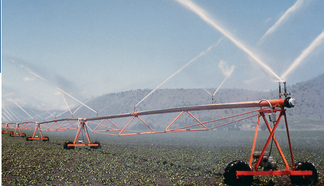
Irrigation pipe should be moved in a horizontal position under and near all power lines to keep it away from the lines overhead.