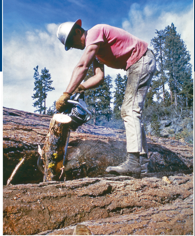
Cutting trees within power line rights-of-way can be dangerous. It is safer to have BPA do it for you.

Under some circumstances, voltages and currents from power lines and electrical devices can interfere with the operation of some implanted cardiac pacemakers. However, we know of no case where a BPA line has harmed a pacemaker patient.