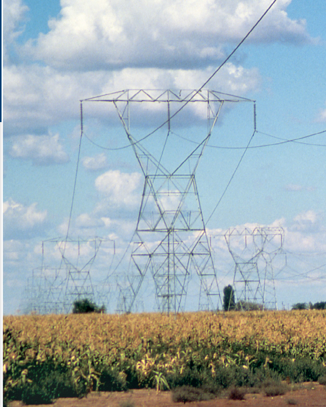
Most crops, less than 10 feet in height, can be grown safely under power lines.

Unlike the wiring in a home, the wires of overhead power lines are not enclosed by electrical insulating material.